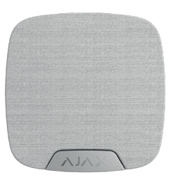
HomeSiren Wireless indoor siren